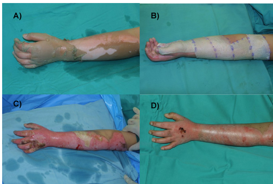
Fig. 1 – (A) A 5-year-old girl with flash burn due to hydrogen gas balloon explosion resulting in 14% partial-thickness burn on both upper limbs and face. (B) Sheets of GPA were applied over the left upper limb and secured with tissue glue. (C) After 10 days of GPA application, the GPA loosened and was removed with ease. The burn wound had achieved 97% epithelialisation. (D) By day 13 postburn, the wound had healed completely without limitation of joint movement.

dressing, was secured with stapler or tissue glue and reinforced with absorptive secondary dressings. The wound inspection was performed every 5–7 days and only the secondary outer dressings were changed (Fig. 1).